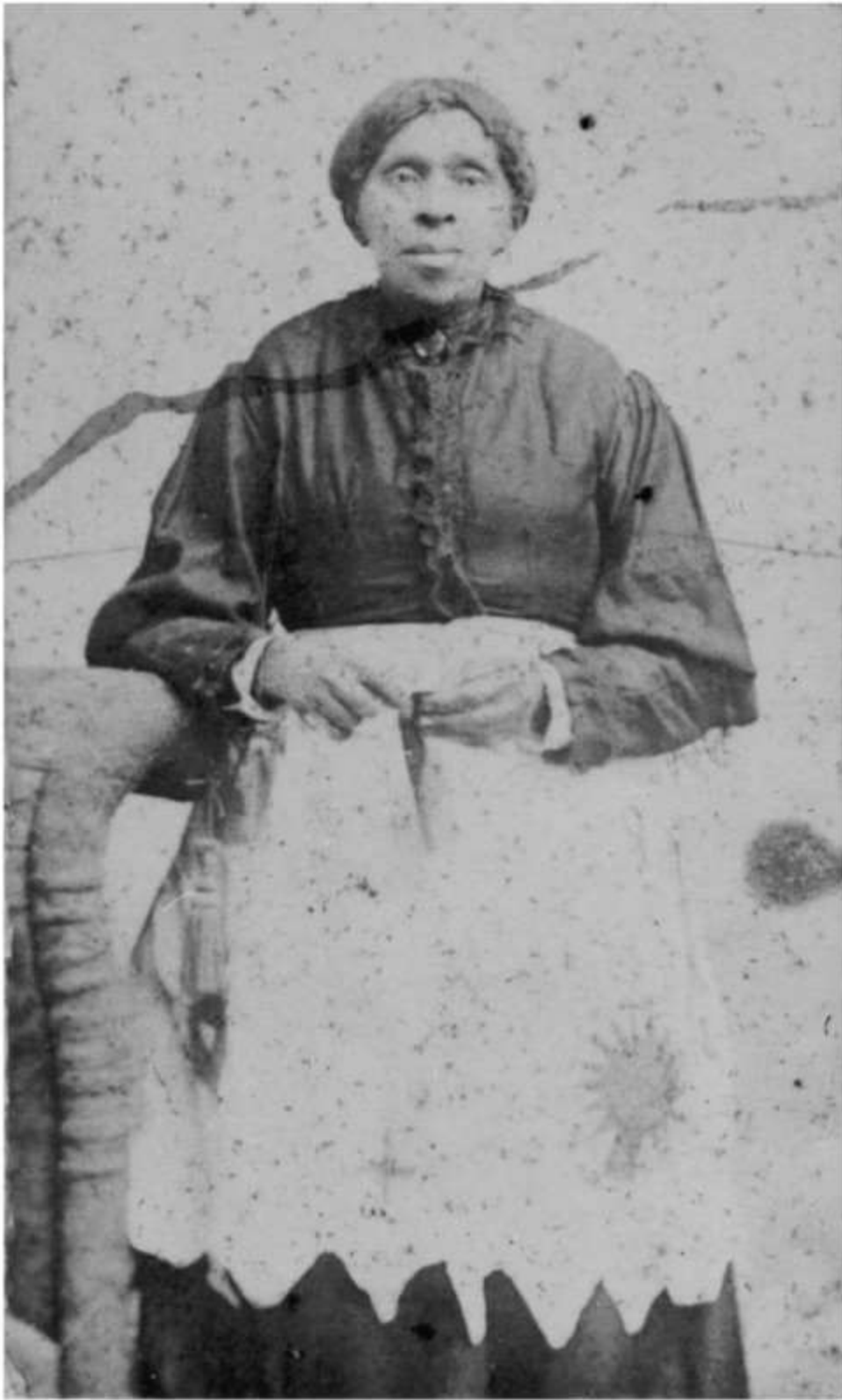
The only photograph of Harriet Powers. Textiles in Context.